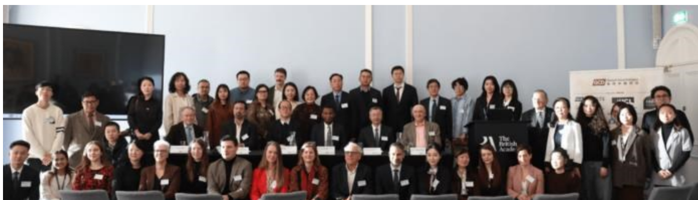
Group photo at the end of the Opening session.