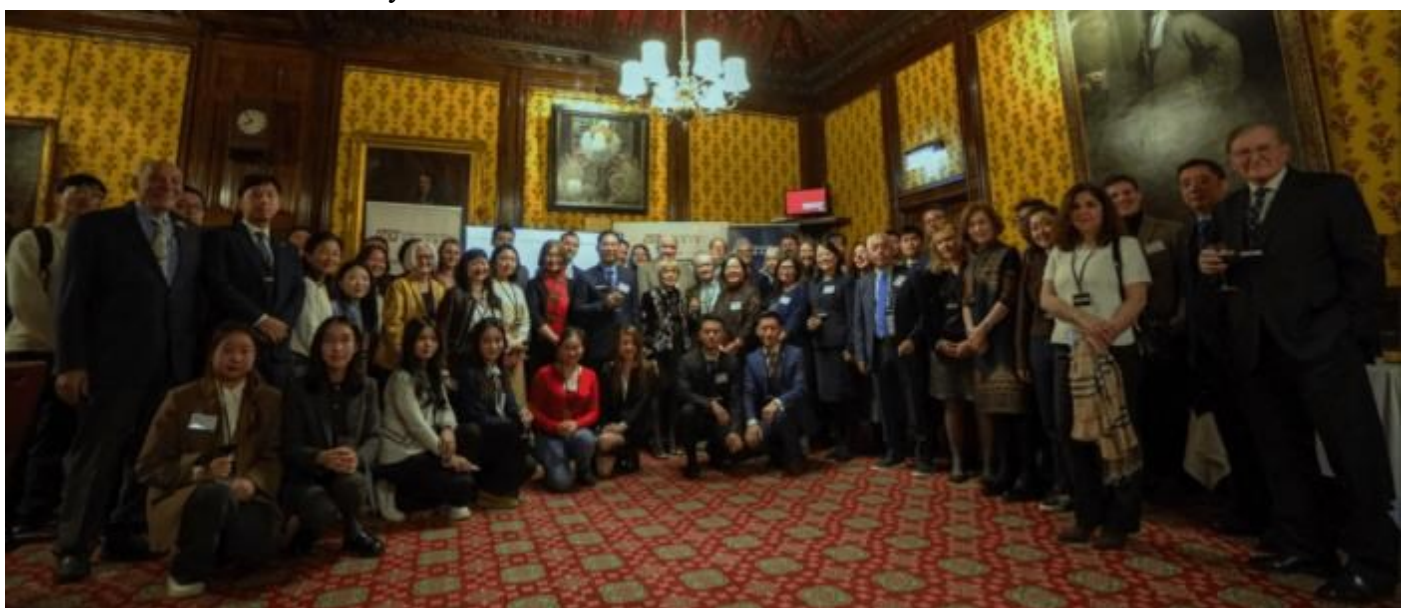
Participants at the launch of the new websites