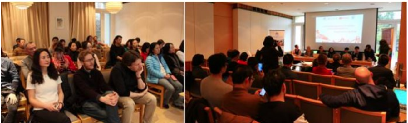
Above: The symposium at Pembroke College.