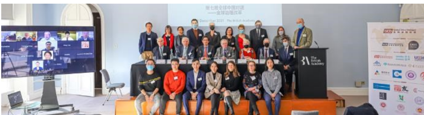
Participants in the morning session.