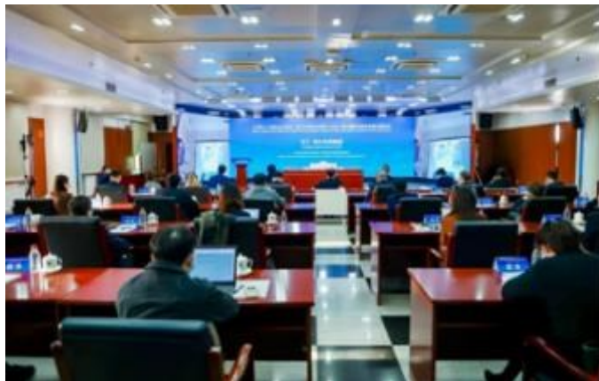
Left photo: the main venue in Beijing

On 6 th April 2022, a book launch ceremony and forum on China and the Shared Human Future: Exploring Common Values and Goals (revised English edition, hardback and paperback) were held during the London Book Fair. The event was organised by the Chinese Academy of Social Sciences (CASS), China Publishing Group Co. Ltd., the Institute of European Studies and the China National Publications Import & Export (Group) Co. Ltd., and co-organized by Global Century Press, UK, and New World Press, China. H.E. Ambassador Zheng Zeguang , China's Ambassador to the UK, and Ms. Violeta Bulc, Former European Commissioner for mobility and transport of European Commission and Former Deputy Prime Minister of Slovenia, delivered online speeches.