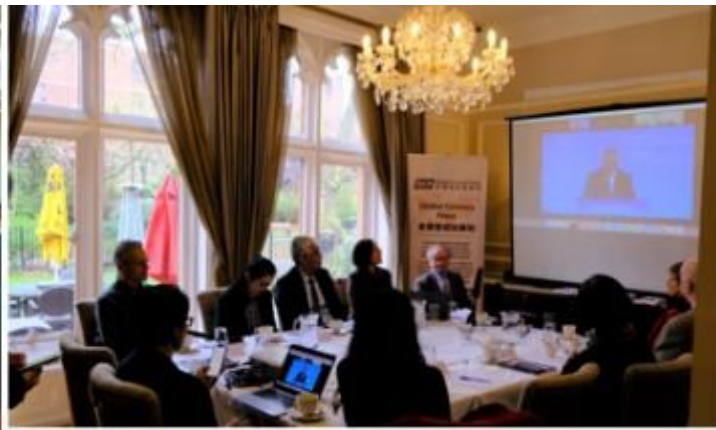
Right photo: the sub-venue in London.