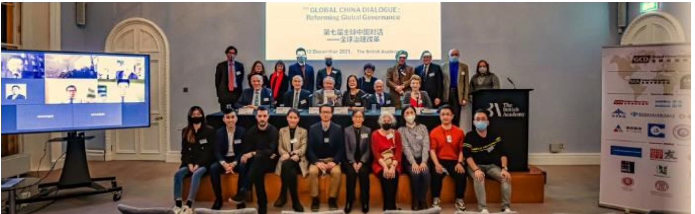
Participants in the afternoon session.