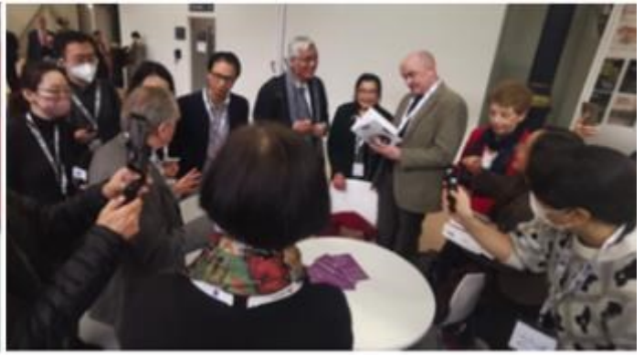
Left: At the London Book Fair, Global Century Press exhibited five books including the hardcover and paperback editions of China and the Shared Human Future: Exploring Common Values and Goals (English version), the Overseas Chinese edition of Levelling Mountain-high Gaps , and the English and Overseas Chinese editions of Battling the Virus: Witnessing China Combating COVID-19 . Right: Participants and visitors handing round the books for perusal and comment at the China Publishing Group stand.