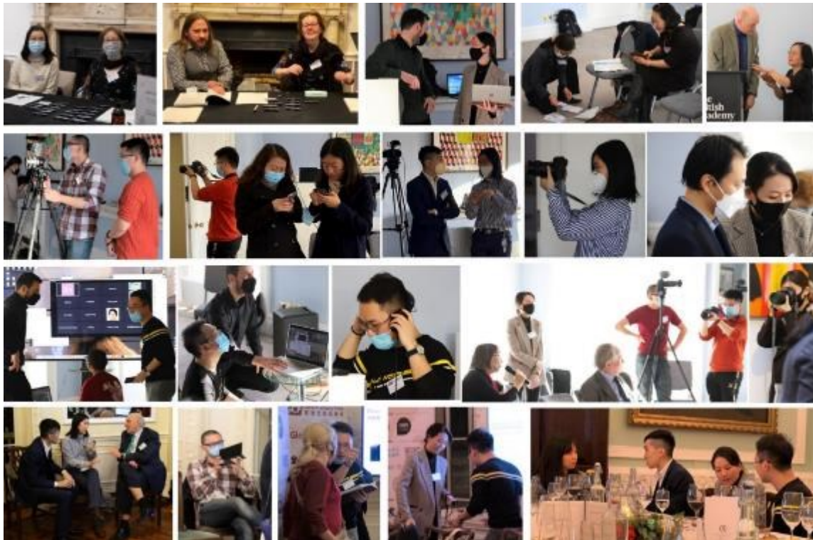
Many thanks to staff and volunteers for their help in many and varied ways, before and after the event and on and off site, in making a success of the GCD VII and associated events.