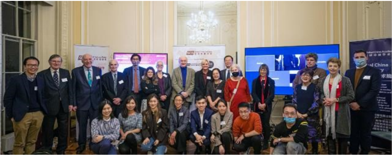
Participants at the Reception in which GCP's new publications were launched and GCD VIII's theme was announced.