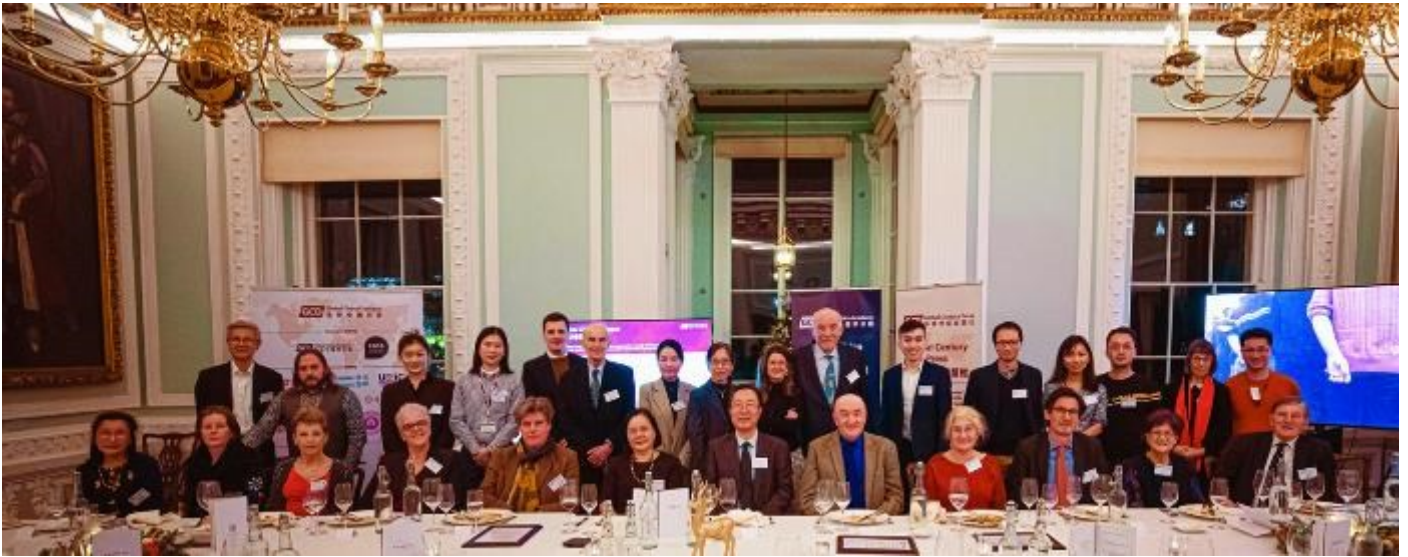
The Dinner marked the conclusion of the Global China Dialogue VII and associated events.