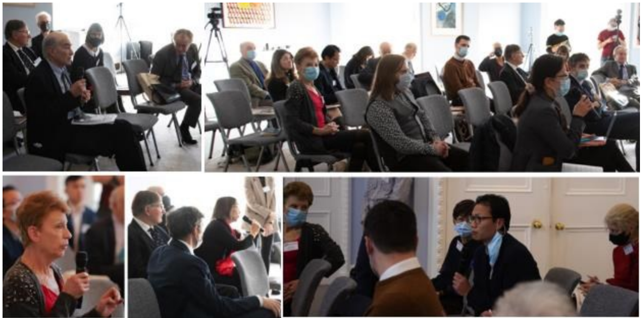
Q & A sessions during the GCD VII.